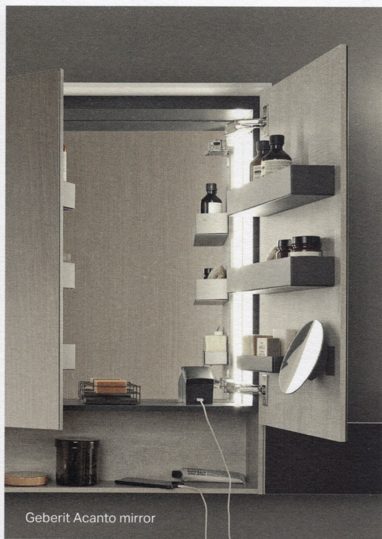
Geberit Acanto mirror