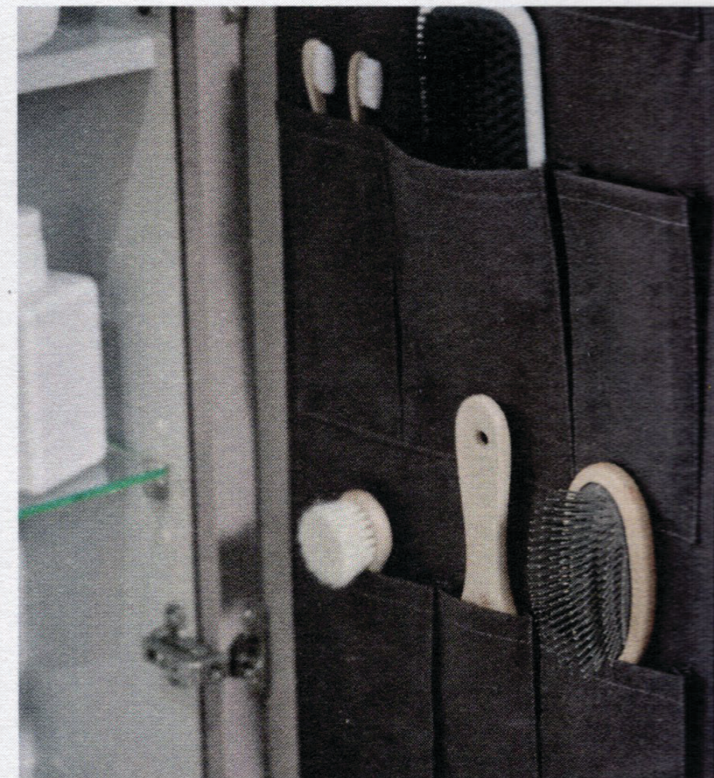
Geberit myDay furniture