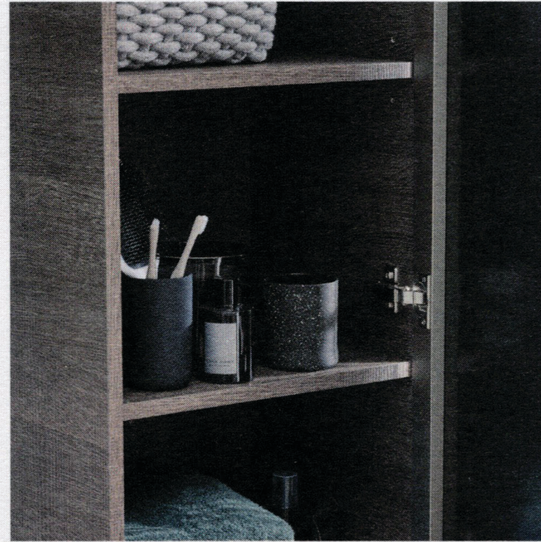
Geberit Citterio furniture

There's also an increase in having statement freestanding units that have everything you need in the one space with all wires or pipes concealed. Think free standing larder cupboards, or an island in the kitchen that has secret compartments containing sockets for your toaster and kettle and drawers that, when pulled out, reveal handy plug sockets and iPhone chargers.