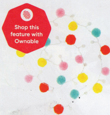
Deck out the bed frame with a line of cheery, colourful fairy lights. Pom-pom string lights, £16.50, Red Candy