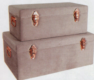
House toys and play things in smartly stacked boxes. Velvet Pink storage trunks, £74.99 for two, Beautify