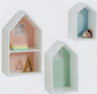
Display favourite things in house-shaped cubbies. Townhouse wall shelves, £36 for three, Great Little Trading Co

Calm colours and cute buys make for a dreamy bedroom