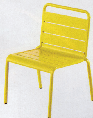
Go for bold seating to add a pop of colour. Children's Yellow metal chair, £54.50, Maisons du Monde