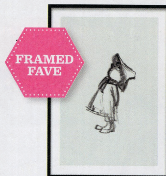
Decorate the walls with a selection of illustrated book characters. Snufkin poster, from £7.95, Desenio