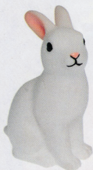
Create a cosy glow at bedtime with a mini bunny lamp. Rabbit night light, £4.95, Rex London