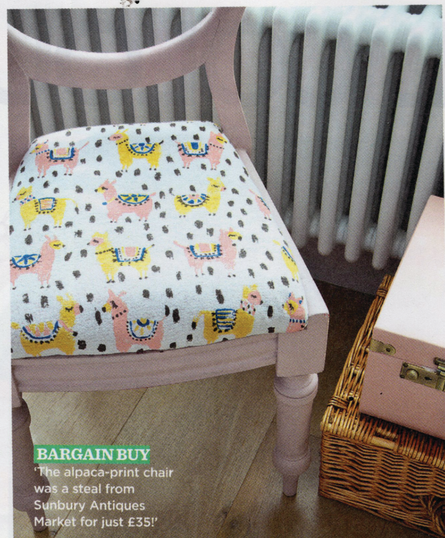
BARGAIN BUY 'The alpaca-print chair was a steal from Sunbury Antiques Market for just £35!'