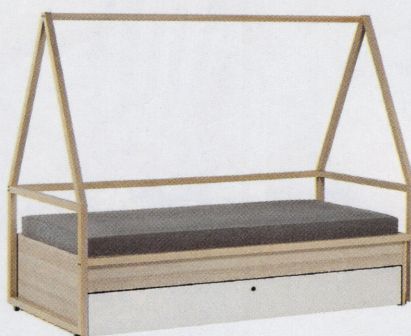
Play house with a fun-shaped bed. Vox Spot kids tipi bed and frame with trundle drawer, £395, Cuckooland