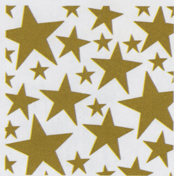
Create your own magical mural. Mini wall star stickers, £16 for a set of 49, This Modern Life