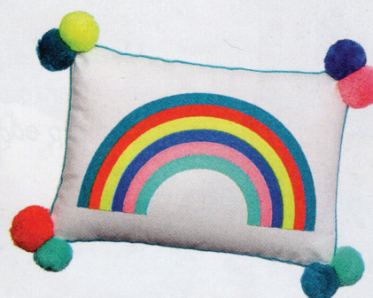
Bring in plenty of colour and cosy up the bed with fun motifs on textiles. Rainbow cushion, £35, Sweetpea & Willow